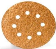
For Bosch, B&D, Makita, etc.