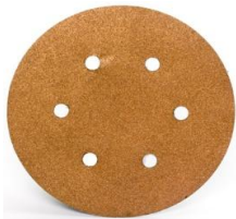
For Bosch, B&D, Makita, etc.