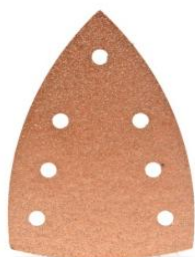
For Festool DTS 400