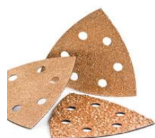
For Bosch, B&D, Makita, etc.