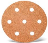
For Festool RO 90 DX 4in1